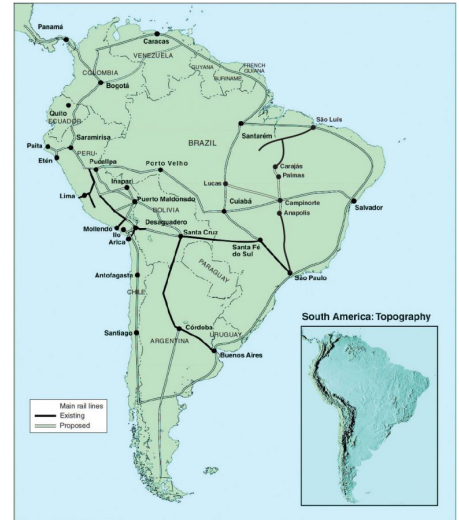
Caribbean Basin Belt and Road

9) Argentina must also join the world's space-faring nations , as India just succeeded in doing with its Chandrayaan-3 moon landing. Argentina already has an active space program, and Brazil's Alcântara space launch facility near the Equator is the perfect center for a cooperative South American effort, along with international allies from among BRICS nations and others. The Alcântara base (and the European Union's space facility in Kourou, French Guiana – should they choose to join the effort) can serve as the hub for the rapid training of a highly productive, skilled labor force for the entire region. This can be taken up at the same mid-October international conference, with the critical addition of India as a participating nation. After all: If India can do it, why not we?